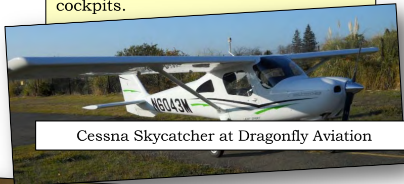
Cessna Skycatcher at Dragonfly Aviation