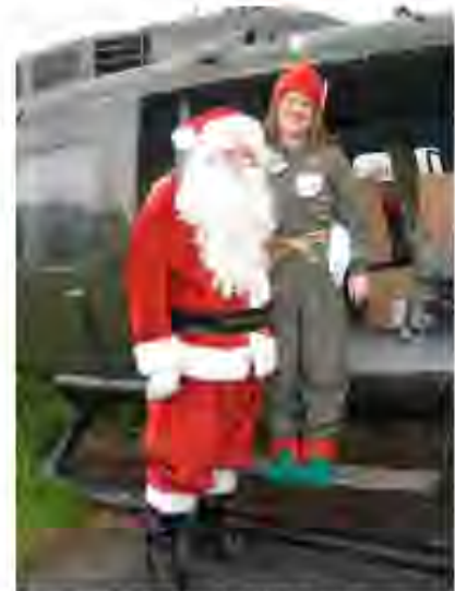
Santa and one of his Elfish flight crew

This event is free, the Museum's gift to the community. So you don't have to wait in a really long line we will give every child a numbered ticket. We will use our PA system to call 25 ticket holders at a time to line up for Santa. Pick up your ticket in the Gift Shop as you arrive.