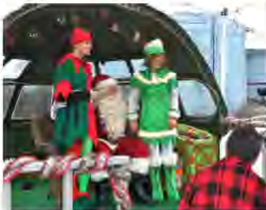
During a previous visit, the Jolly Old Eli prepares to take requests from young hopefuls as a couple of his Elves stand by for crowd control.

Santa Claus will arrive at the Pacific Coast Air Museum a little early, on December 15! And he's traded in reindeerpower for horsepower, leaving his sleigh back at the North Pole and arriving instead in a special 21st Century sled. Thanks to the folks at REACH Air Medical Services, Santa will be flown to the PCAM Landing Zone by helicopter! After Santa arrives around 10:30 he will set up shop on a stage by the F-15 with his bag of treats and will take requests from all kids. Every child will get a free bag of goodies. While the kids wait to see Santa they can get their faces painted and play in the jumpies.