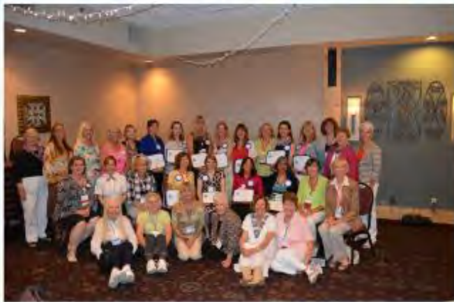
AE Scholarship Winners Past and Present

After the speaker we attended the AE Luncheon. This is always a highlight of the convention. It is so inspiring to hear the stories of this year's AE Scholarship winners.